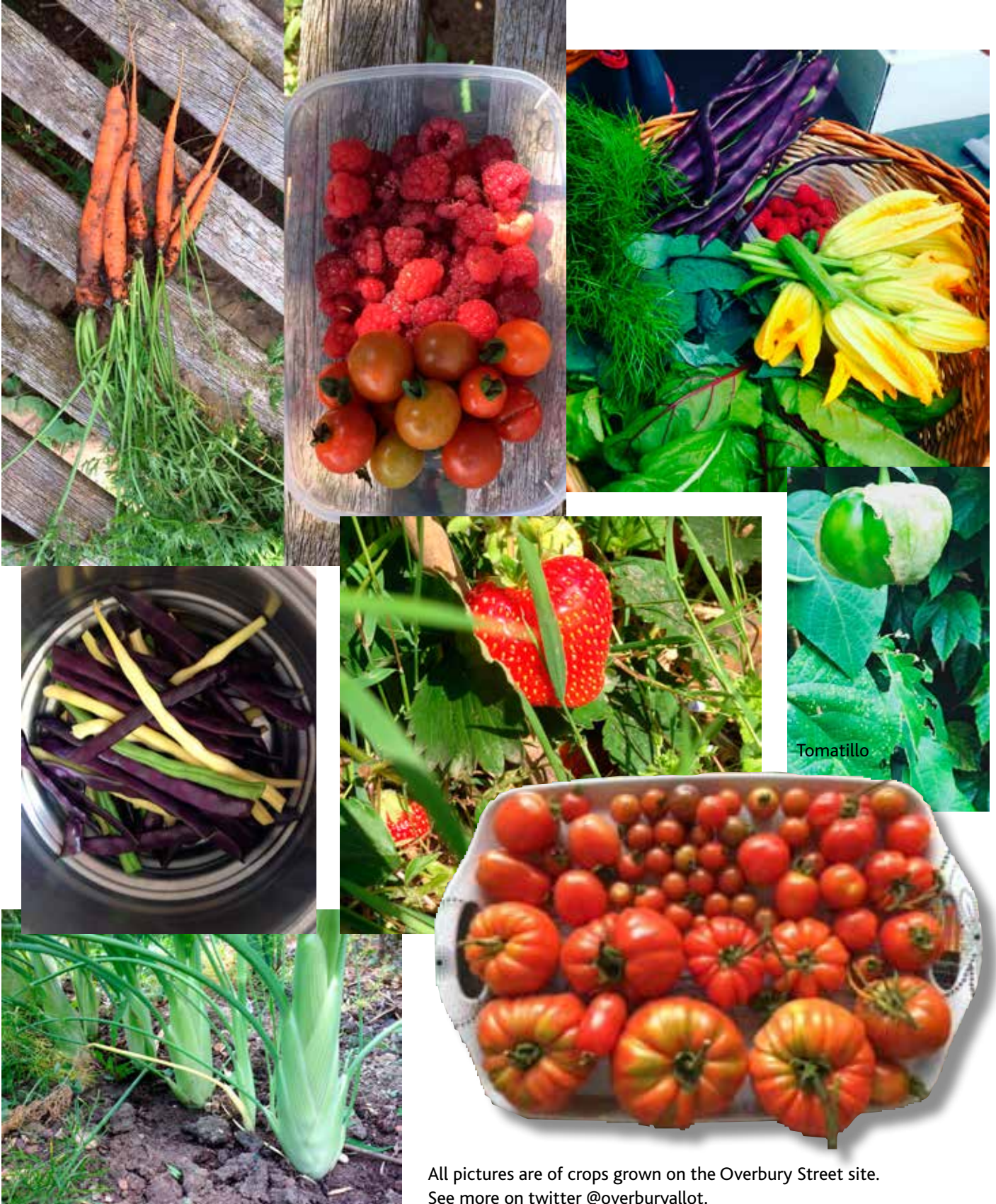
All pictures are of crops grown on the Overbury Street site. See more on twitter @overburyallot.

Take part and share your successes or design features in the next newsletter! Email your pictures to hasnews@mac.com or secretary@hackneyallotments.org.uk