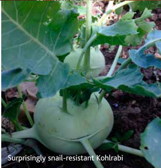
Surprisingly snail-resistant Kohlrabi